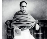
Iswar Chandra Vidyasagar