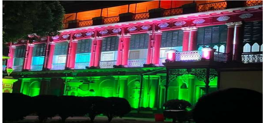
Visit to Jorasanko Thakurbari, Kolkata and Light & Sound Show on 4 th December 2024 by IISRR World Conference 2024 Resource Persons