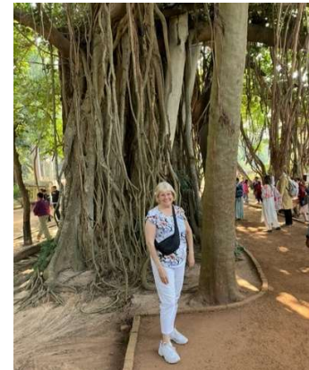
Visit to Shantiniketan on 8 th December 2024 by IISRR World Conference 2024 Resource Persons