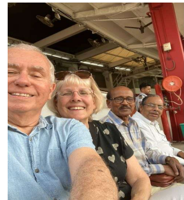
Visit to Eden Gardens, Kolkata on 4 th December 2024 by IISRR World Conference 2024 Resource Persons